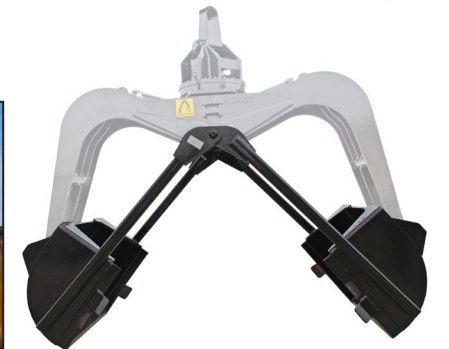
Grapple Arms Slip Into Sand Bucket & Hold In Place Via Gravity

NOTE: Northshore Manufacturing reserves the right to change specifications and prices without notice in order to follow its policy of constantly striving to manufacture a better product without incurring any liability to provide these new features on any units previously manufactured.