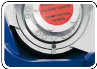
housing locking mechanism